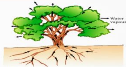
Figure 6.12 Movement of water during transpiration in a tree

Thus, transpiration helps in the absorption and upward movement of water and minerals dissolved in it from roots to the leaves. It also helps in temperature regulation. The effect of root pressure in transport of water is more important at night. During the day when the stomata are open, the transpiration pull becomes the major driving force in the movement of water in the xylem.